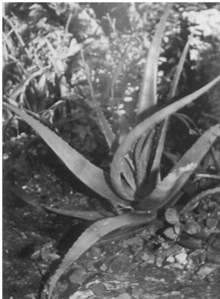
Plate 1.1. Aloe vera growing in the natural habitat

The field surveys were made extensively in the study area. Raunkier's frequency classification has been followed to explain distribution of Aloe as rare, frequent, common or abundant in the study area. The nature of habitats was also examined. From phytogeographic study point of view, a cartographic interpretation of this multi-purpose plant species will be dealt at both macro and microlevel.