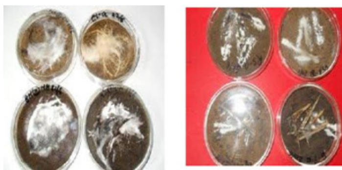
Fig.1. Baited plates with fungal growth.

Soil samples collected from different habitats of Jaipur were found alkaline with the exception of bird habitat found slightly acidic (pH=6.9). Alkaline soil promotes growth of keratinophilic fungi mainly Chrysosporium tropicum (pH-8.0), Microsporum sp. (pH-9.0) and Trichophyton sp. (pH-8.0) responsible for causing tinea infections (Sharma 2014). Chrysosporium sp., Torula sp., Gymnoascus sp., and